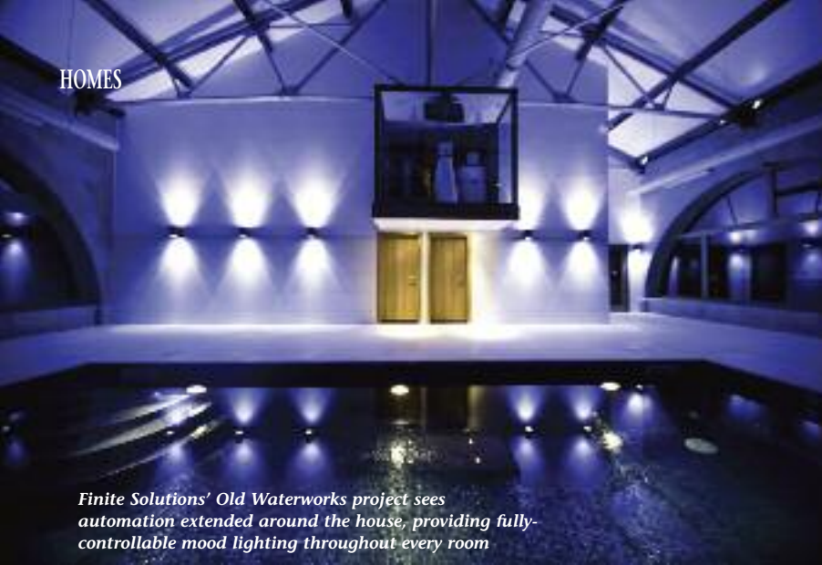
Finite Solutions' Old Waterworks project sees automation extended around the house, providing fully-controllable mood lighting throughout every room