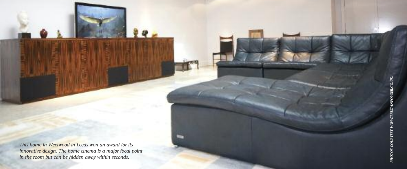
This home in Weetwood in Leeds won an award for its innovative design. The home cinema is a major focal point in the room but can be hidden away within seconds.