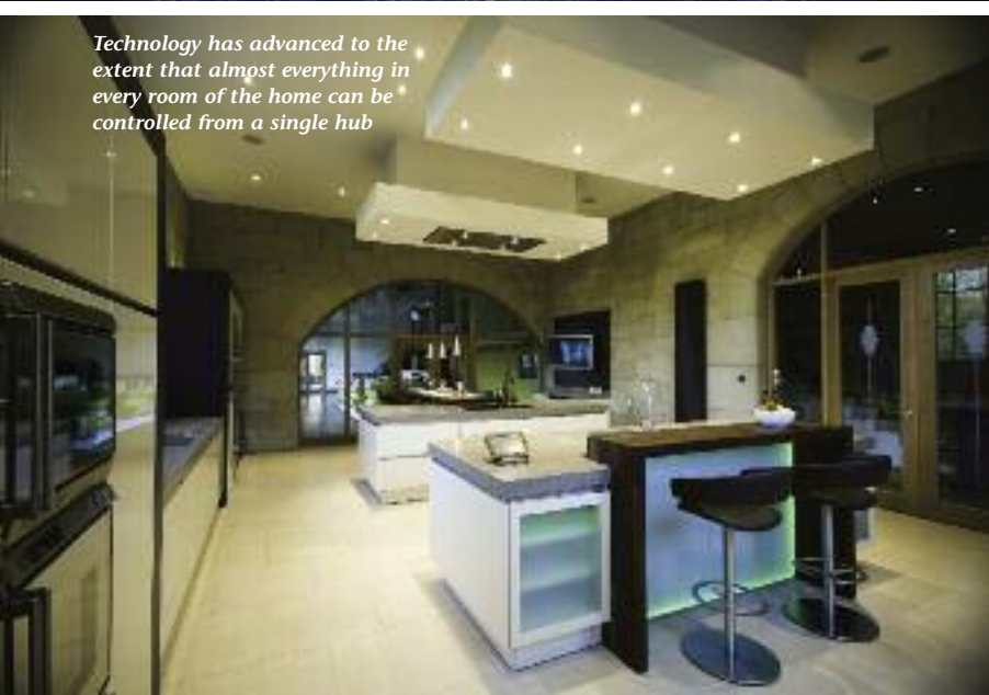
Technology has advanced to the extent that almost everything in every room of the home can be controlled from a single hub