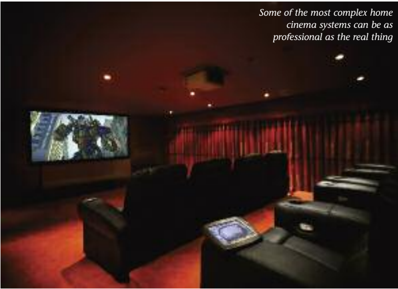
Some of the most complex home cinema systems can be as professional as the real thing