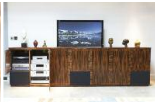
The bespoke designed Macassar Ebony cabinet is a great piece of furniture, and when the cinema screen is lowered it is virtually unnoticeable

Increased technology has meant ever more futuristic homes, with ultra-professional entertainment systems being produced with residents' desires as the forefront. A Leeds company has won numerous awards for their breathtaking projects