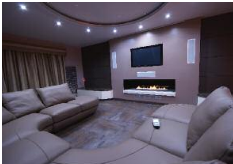
Bespoke home cinema and automation projects invariably run the cables through in the building stage so they are completely hidden from view in the finished project. Additional cables also allow for upgrades and the introduction of added hardware later

the experts working it all out. Some of these can be so effectively realised that they take your breath away, and this is particularly the case at the residence of Mr Tomasso, a fine art and furnishing dealer who lives in a contemporary wing of a nineteenth century Gothic mansion in Weetwood in Leeds.