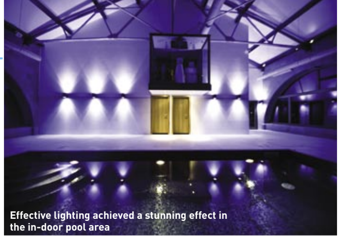
Effective lighting achieved a stunning effect in the in-door pool area

The building itself displayed a fair amount of reactance to Radio Frequency Interference, which interfered with the RF remote controls. Using the infrastructure cabling which had been installed, Finite was able to place RF receivers and transmit the signals via cable connection directly into the controller hub in the comms room.