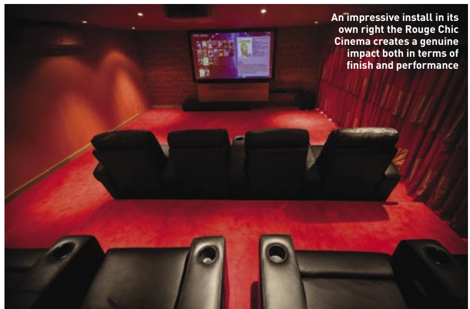
An impressive install in its own right the Rouge Chic Cinema creates a genuine impact both in terms of finish and performance

the breakers for all electrics in the building. Because of this, separate runs of audio visual cabling throughout the house had to be installed. To achieve this, special drilling equipment had to be employed as the age and construction of the